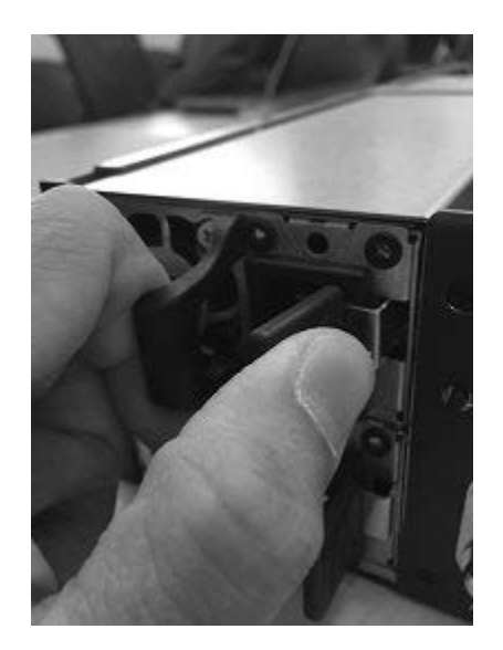
FIGURE 2 Unlocking the PSU

4. Hold the lock, and pull the handle of the PSU away from the chassis to remove it.