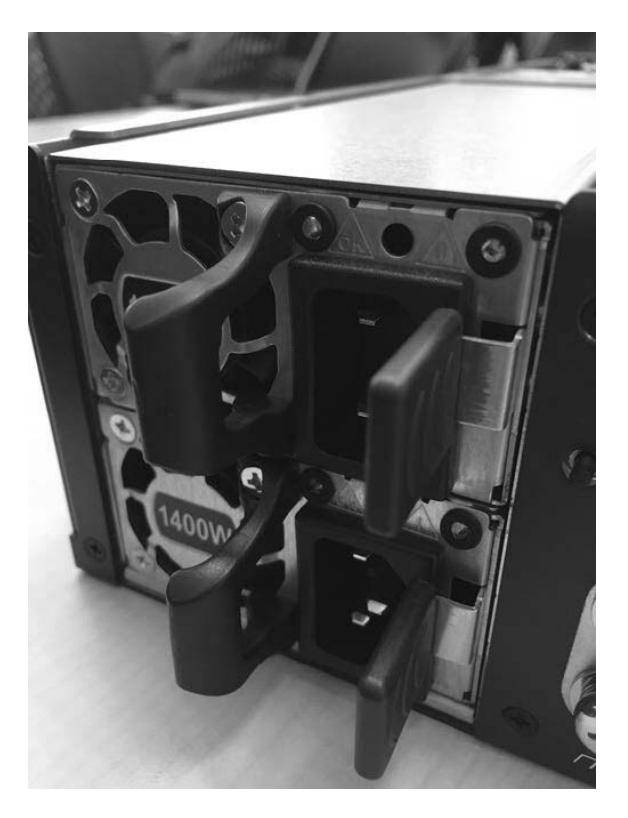
FIGURE 1 AC PSU

1. Locate the PSU that must be replaced.